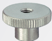
A : Nut