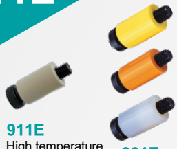
911E High temperature resistance